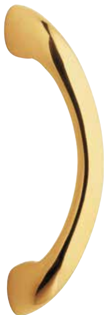
325 MS - PVD